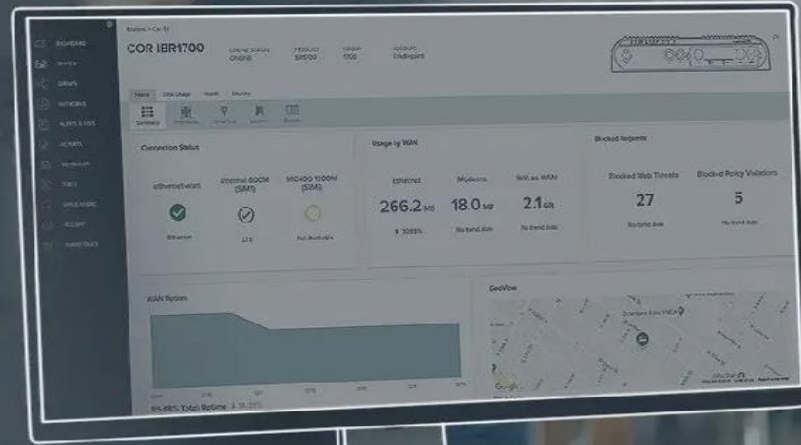
Cradlepoint NetCloud Manager

Help your customers embrace a digital world and 5G future